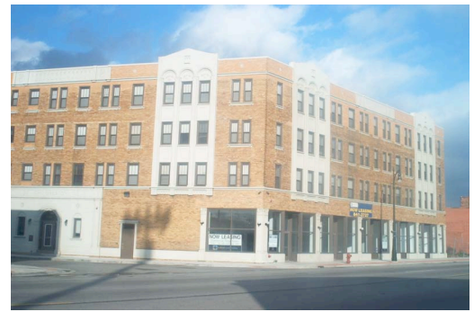
Five Retail/Office Suites along Michigan Avenue.