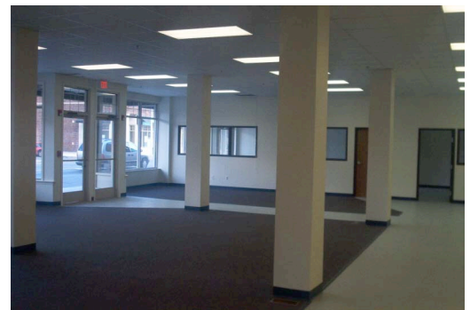
Proposed Retail/Office Space.