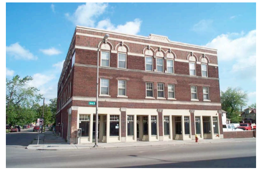
Two Retail/Office Suites along Vernor Highway.