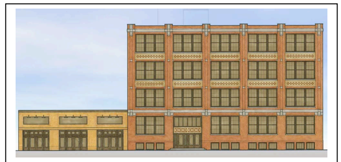
Proposed Rendering of the building; Renovations to be completed by Fall 2010.